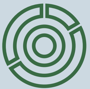
AAU competence strategy