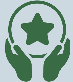
AAU Framework for crediting University pedagogical competences (Danish)