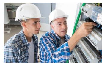
Working with high voltage requires training and instruction.