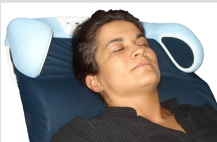
Picture 1. The music player and the pillow used in the study. The music player and the ergonomic pillow were used by the participants in the intervention group. The control group used only the ergonomic pillow.

Sleep disturbance is a core feature of the PTSD diagnosis 1 , and studies indicate that about 70% of the persons with PTSD experience difficulties falling or staying asleep 2 . In addition, a high correlation has been found between PTSD symptom severity and sleep disturbances, and it is argued that sleep focused treatment should be incorporated into standard PTSD treatment 3 . Studies have found that music listening can improve sleep quality in persons with sleep problems due to depression 4 and schizophrenia 5 , but the effect on trauma-related sleep problems has not been studied. Therefore, the aim of the present study was to investigate the effect of bedtime music listening on subjective sleep quality in traumatized refugees.